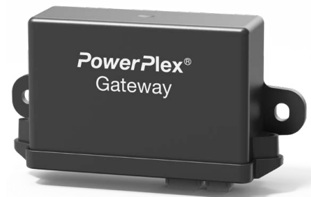
The PowerPlex® Gateway allows easy networking of a PowerPlex® system with another bus system.